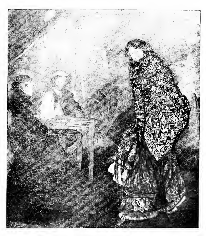
ZULOAGA'S PORTRAIT OF LUCIENNE BRÉVAL AS CARMEN, ACT II